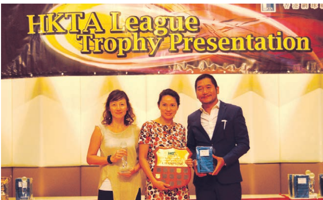
Summer League 2015 - Ladies' A Division Winner: South China Athletic Association – Team 1