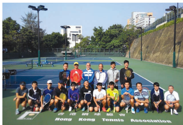
ITF Endorsed HKTA Coach Certification Scheme

In view of the need for more quality coaches and the growing demand for certified tennis coaches, the HKTA has been collaborating with the ITF to run a Certification Scheme in Hong Kong since 2003. Over the years, 1 Advanced Coach Course, 13 Development Coach Courses, 37 Elementary Coach Courses and 41 Mini Tennis Instructor Courses have been organized. In 2015, 122 candidates attended the certification scheme in 3 Mini Tennis Instructor Courses, 1 Elementary Coach Course, 1 Development Coach Course, 1 Mini-tennis Refresher Course and 2 Elementary Refresher Courses that CDQC organized.