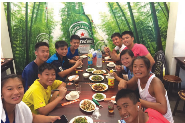
Taiwan Training Camp