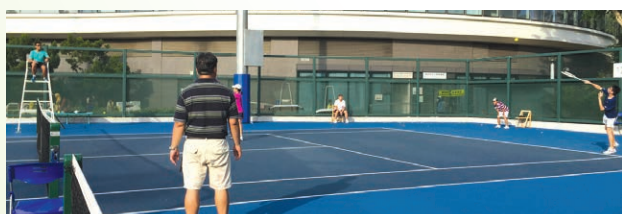
HKTA National Level Umpire Course

Below is a breakdown of the qualifications of HKTA officials: