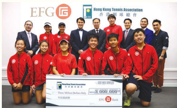
Junior Tennis Elites at the ceremony