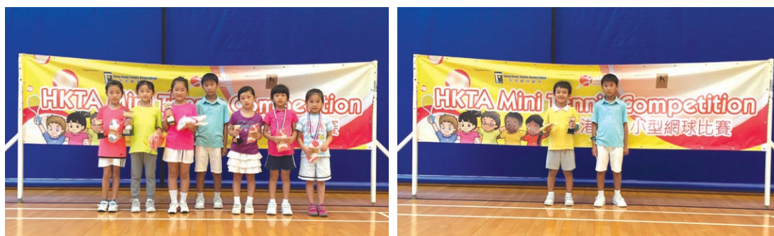
HKTA Mini-Tennis Competition 2015 Prize Presentation Ceremony

Mini tennis competition is a starting point for players aged 6U. The TC organized 4 competitions in 2015 in Smithfield Sports Centre, Tai Kok Tsui Sports Centre, Shek Kip Mei Park Sports Centre, Sun Yat Sen Memorial Park Sports Centre. Over 600 kids participated, an increase from 500 kids in 2014.