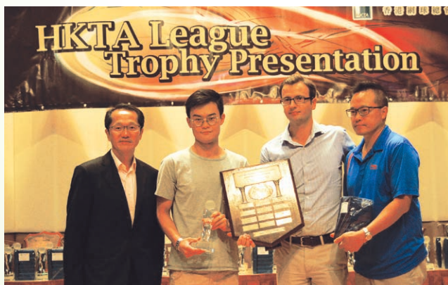
Summer League 2015 - Men's B Division Winner: Hong Kong Football Club - Team 1

The annual League Presentation Ceremony was held on September 7, 2015 at the Jockey Club Lecture Theatre in Olympic House and saw the prizes for the 2014/15 Winter League, 2015 Summer League, 2015 Veterans and Mixed Doubles leagues and the 2014 Autumn and 2015 Spring Junior Leagues awarded to captains of the winning and runner-up teams. In the Men's A+ division, CRC took home the league cup in the 2014/15 Winter League, with HKCC the runners up, whilst HKCC were victorious in the 2015 Summer League and IRC placed second. In the Ladies A+ Division, KCC and CRC held the top 2 spots, with KCC capturing the 2014/15 Winter League title and CRC taking the 2015 Summer League. The 2015 Mixed Doubles League was won by CRC for the third year in a row, finishing two points ahead of second placed IRC 1. The Men's Veteran's 80+ league was captured by HKCC, whilst the 100+A and 120+ were won by KCC and KTHOA respectively. FCTC 1 took the Women's 80+ Veterans League. In Junior Team Tennis, the Autumn 2014 League Division A was won by KTC and Division B was won by NUTC, whilst in the Spring 2014, NUTC won in Division B.