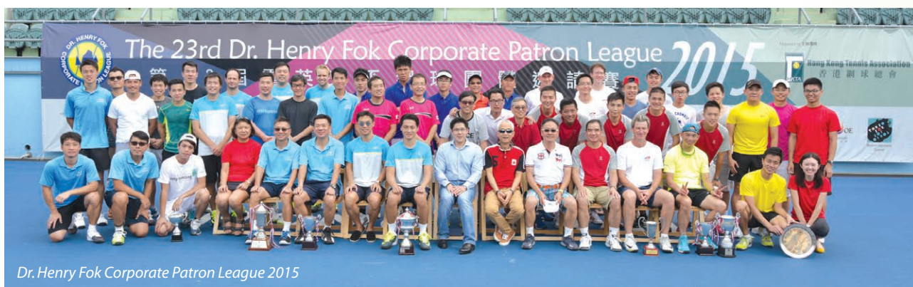
Dr. Henry Fok Corporate Patron League 2015

The Membership & Corporate Affairs Committee is responsible for the communication with, and the dissemination of news and information to HKTA members, affiliated and league clubs, sponsors, tennis enthusiasts in the business sector and the wider public. The MCAC also maintains the HKTA's membership, provides membership services, and procures sponsorship for the HKTA and its events.