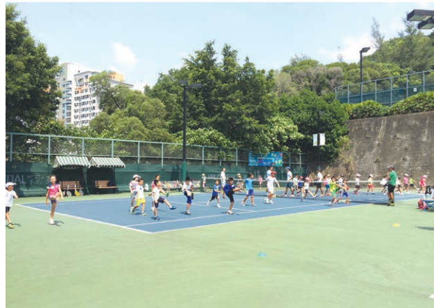
Young Athletes Training Programme Selection

The Young Athletes Training programme is designed for players aged 10 and under and the training was using Green balls and was closely monitored by our Technical Executive and a group of HKTA licensed coaches. Players in this programme need to fulfill the requirements set, such as attendance and tournament commitment.