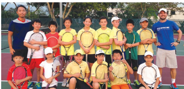
Shek Kip Mei Training Group

Apart from training, there were 8 match play days between centres organized for 8U and 10U which provided more opportunity for more players to play more matches and improve their standard. There were over 100 players participated in the match play.