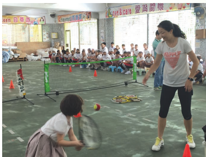
YAN Zi at a tennis clinic with kids

The PDC would like to take this opportunity to thank the HKTA Council for its support during the year. The PDC would also like to thank Prudential Hong Kong, EFG Bank, Sports For Hope Foundation and Wilber Foundation for its financial support, the Leisure and Cultural Services Department for its funding, the management of the HKSI for their continued support and grants awarded over the years and Prince, Dunlop, Head, Wilson, Yonex-Sunise and Babolat for their generous sponsorships. The PDC would also like to recognise the hard work of the HKTA National Coaching Team and Staff, all the licensed coaches, teachers and players who have given so much support to the PDC during the year, and the player's parents for their advices and trust in us.