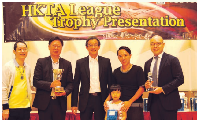
Winter League 2014/15 - Men's C Division Winner: Craigengower Cricket Club – Team 4