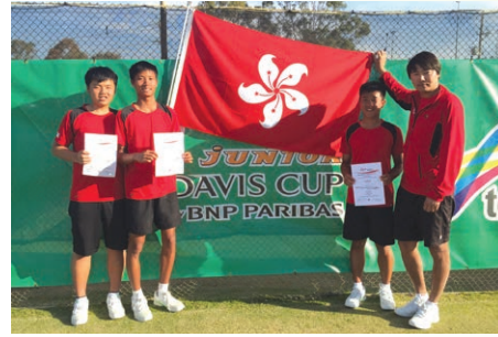
Hong Kong entering the World Finals

The 31st Junior Davis Cup Finals took place at the end of September in Madrid. Hong Kong was drawn in the strong group with top seed and eventual champions, Canada, as well as Czech Republic and Poland. Hong Kong was placed in last place after the group stage and entered the 13-16 place play off. Their opponents were Sweden and South Africa who were too good as they lost 0-3 and 1-2 respectively and finishing their campaign in 16th place.