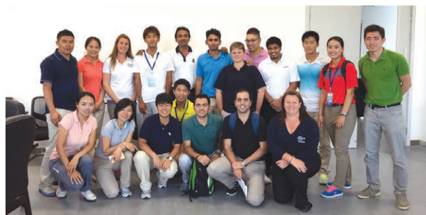
ITF Level 2 Officiating School - Fuzhou (27 Jul - 2 Aug 2015)