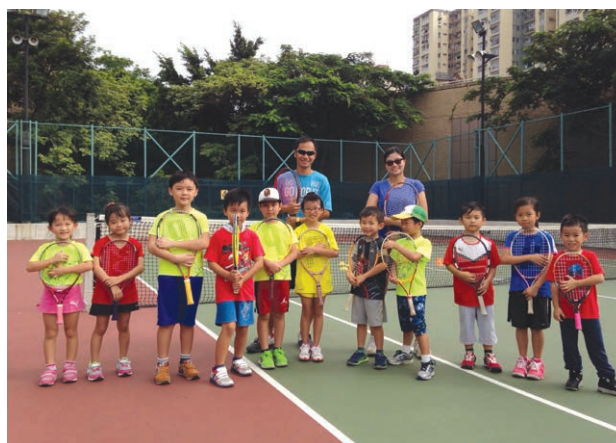
Regional Mini Tennis

The HKTA/Prince Mini Promotion Scheme currently have thousands of students who are receiving or have received mini-tennis training under the Schools Sports Program. The PDC have also organised the Regional Mini Tennis Training Program which provided mini-tennis classes at different levels to help the children to attain good results. In the past summer, training was organised in more venues which successfully attracted more 6 and under players to play the game. We also operated family mini tennis class during weekends, allowing parents to participate with their young children and give them guidance on how to enjoy playing and hopefully will choose tennis as their "sport for life" in 2015, the participation numbers continued to grow and we are looking for a more successful 2016 by adding more fun elements to the program.