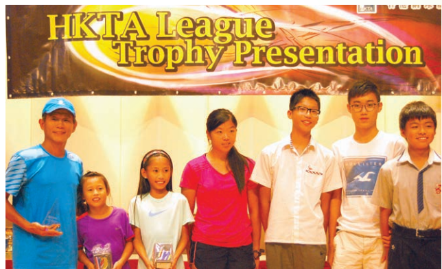
Junior Team Tennis 2014 – Autumn - Division B Winner: New Union Tennis Club