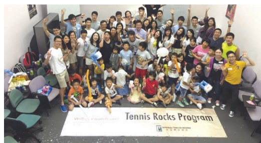
Tennis Rocks Party