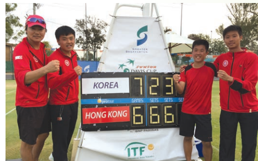
Hong Kong defeating Korea at the Junior Davis Cup Asia & Oceania Qualifying