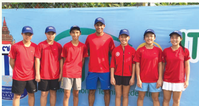
ITF 14U Asian Development Championship