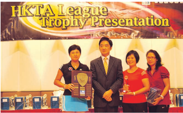
Summer League 2015 - Ladies' A Division Winner: South China Athletic Association – Team 1