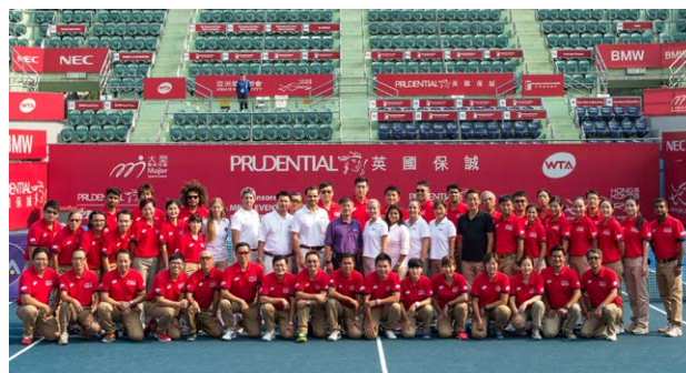
Prudential Hong Kong Tennis Open 2015 Officials