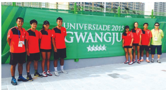
Universiade 2015 in Gwangju, Korea