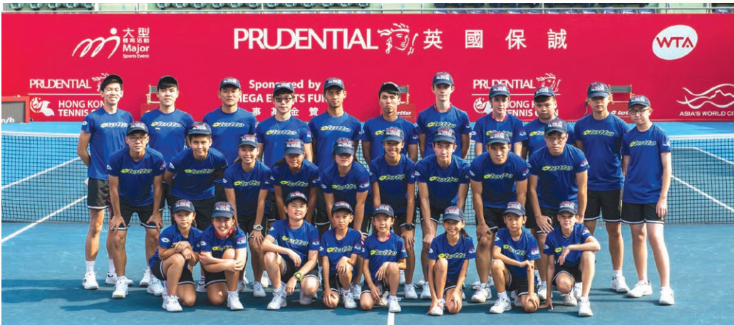
Ballpersons at the Prudential Hong Kong Tennis Open