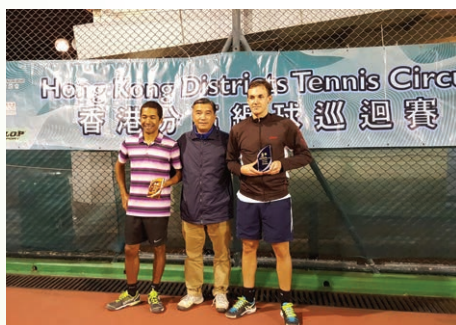
Hong Kong District Tennis Circuit Prize Presentation