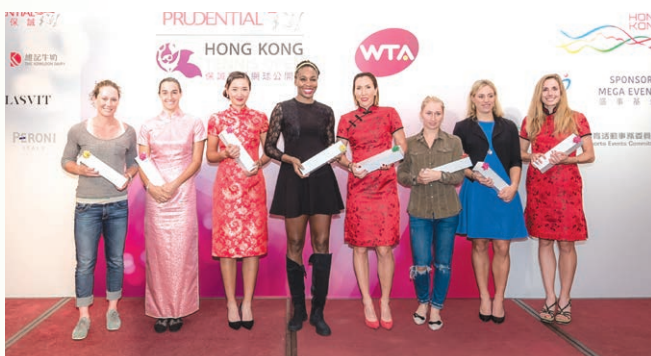
Players Party at the Hong Kong Jockey Club

The Prudential Hong Kong Tennis Open had a much heavier emphasis on community engagement this year in comparison to last year. The Monday of the event week was named "People's Monday" in which the public were granted free access to watch all matches on Centre Court and the two show courts. Throughout the week, the Tournament Village was open to the public, where spectators could enjoy food and beverage stalls, tennis related games and watch the action from Centre Court on a large TV screen. The public could enjoy the matches for free on show courts 1 and 2 throughout the week. The public also enjoyed many ticket discounts leading up to the tournament, including an early bird discount to make the tournament more accessible to everyone in Hong Kong. The HKTA also gave over 9500 complimentary tickets given out to local schools, elderly homes, social welfare/charitable organisations and local community clubs located throughout Hong Kong.