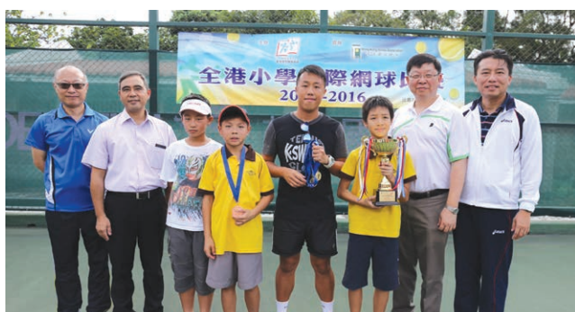
Boys Event Winners