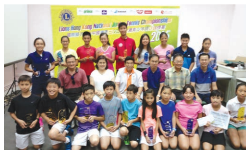
Lions Hong Kong National Junior Tennis Championship 2015 Prize Presentation Ceremony

The Hong Kong National Junior Tennis Championships was once again sponsored by Lions Clubs International District 303 Hong Kong & Macau which has been sponsoring the event for 12 consecutive years. The event was held from 3rd – 16th February, 26th – 8th March 2015 at Victoria Park. The juniors competed in 18 events: Boys' and Girls' Singles 10U, 12U, 14U, 16U & 18U and Boys' and Girls' Doubles 12U, 14U, 16U & 18U and we saw an entry of 760 players, slightly less than 800 in 2014.