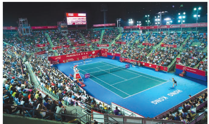
Full house stadium at the finals.JPG