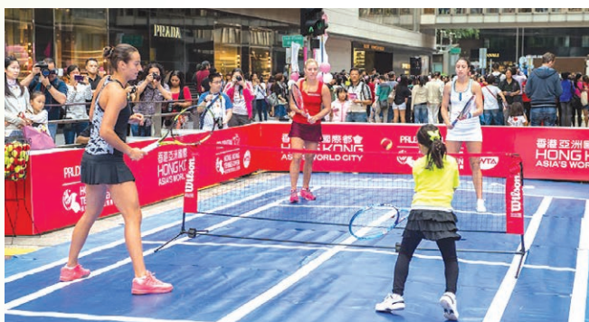
Street tennis at Chater Road