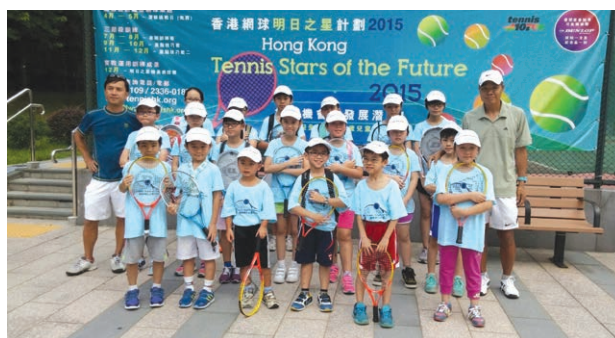
Tennis Stars of the Future 2015

The PDC would like to take this opportunity to thank Dunlop and LCSD for their support in this programme. In the future, we are looking forward to meeting more young kids to discover their sporting potential and experience the joy of tennis through this programme.