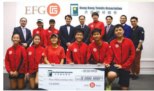
Junior Tennis Elites at the EFG signing ceremony