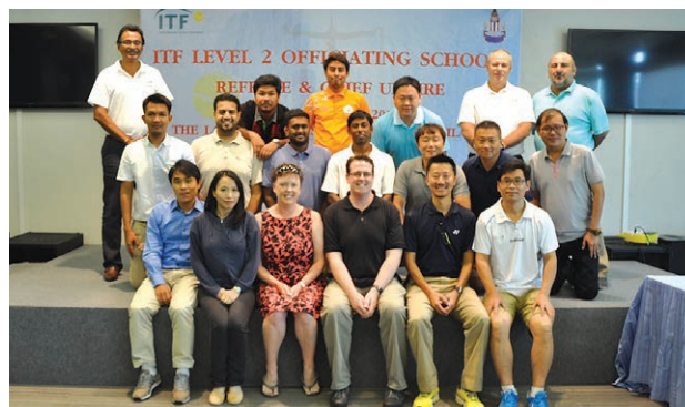
ITF Level 2 Officiating School - Thailand (14-18 Oct 2015)