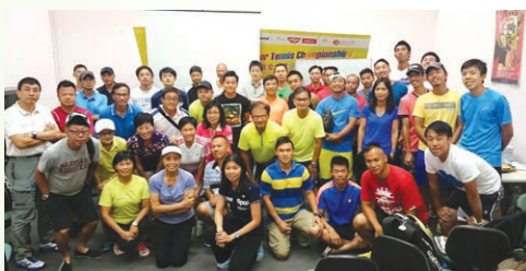
Continuous Professional Development Programme Workshop (July)

The 11 workshops and seminars that were organized have provided an opportunity for licensed coaches to enhance their knowledge in different aspects. The workshops and seminars were very well received by our coaches. Below is a table summarizing the workshops and seminars organized in 2015.