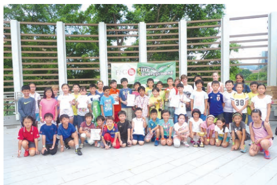
End of Season Party

To recognize the players' hard work and to thank the coaches, the ED End of Season Party was held at King's Park Centenary Centre on 14th June 2015. The event was well-attended by 100 people, including players, parents and coaches. Activities such as inline skating, climbing and a lucky draw were organized and participants have an enjoyable time. Players and coaches with outstanding performance were being honored at the award ceremony. The award list is as below: