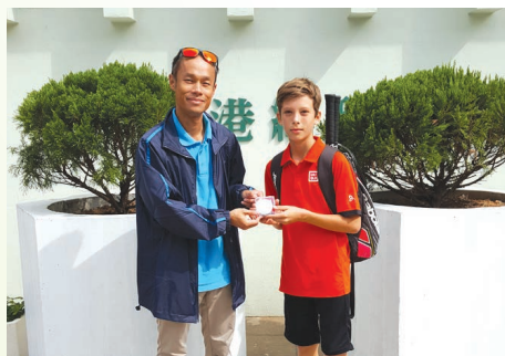
Community Junior Tennis Competition Prize Presentation