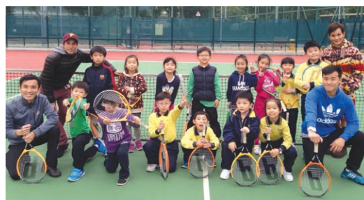
Tennis Rocks - Tuen Mun