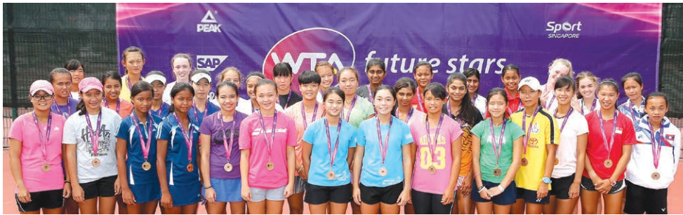
WTA Future Stars