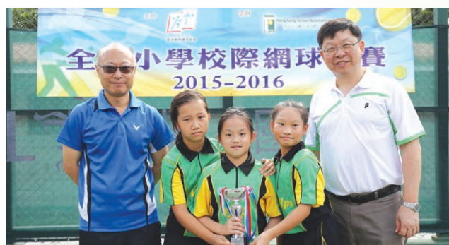
Girls Event Winners