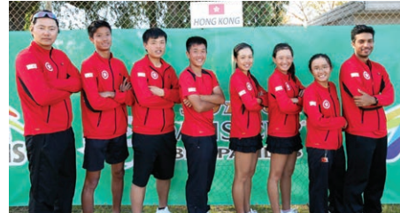
The EFG Junior Davis Cup & Junior Fed Cup Team