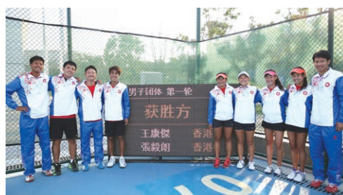
Boys Team wins in Group Event