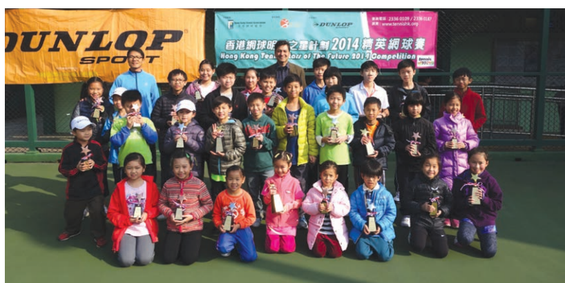
Tennis Stars of the Future Award Presentation