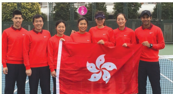
Fed Cup Team