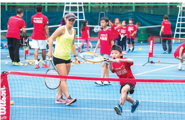
Kid's Day Clinic held at the Prudential Hong Kong Tennis Open