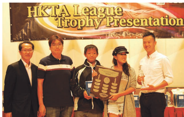
Summer League 2015 - Men's C Division Winner: South China Athletic Association