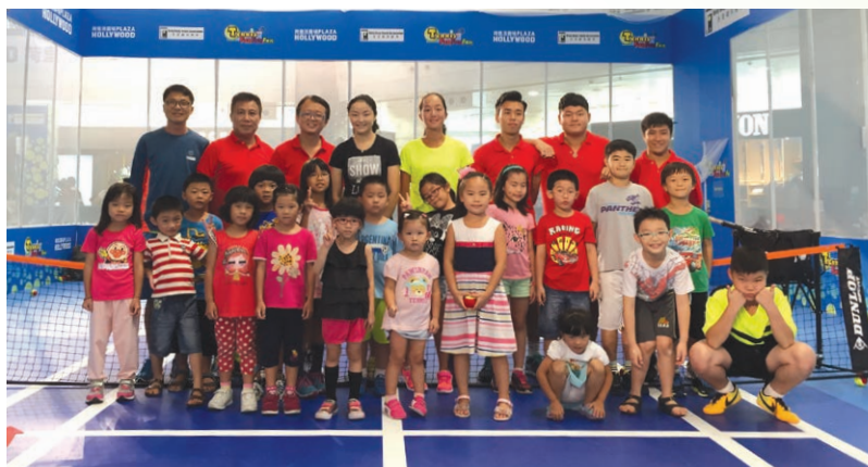
Plaza Hollywood Mini Tennis Campaign

In 2015, the PDC also engaged 2006 Wimbledon and Australian Open doubles champion YAN Zi to help promote tennis to the public. A tennis court at a long weekend in September was set up at Plaza Hollywood to promote the sport through fun games, tennis clinic, photo exhibition and match play. Approximately 2,000 participants attended and enriched their knowledge of tennis.