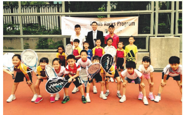
Tennis Rocks Program

During 2015 HKTA had expanded the Tennis Rocks program to Yau Ma Tei, Kwun Tong, North District and Ma On Shan thanks to the support of the Wilber Foundation, Sports For Hope Foundation and Prudential Hong Kong. The Tennis Rocks program is organised by the HKTA for children aged between 6-7 years old that are from underprivileged families. It is an important milestone for HKTA with the development of this program as we are hopeful to witness some top juniors coming through from this program in the next few years.