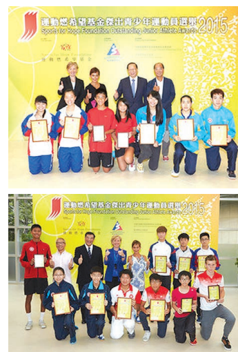
Outstanding Junior Athlete Awards