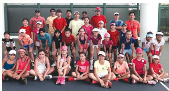
National Training Squad Girls 12U Assessment