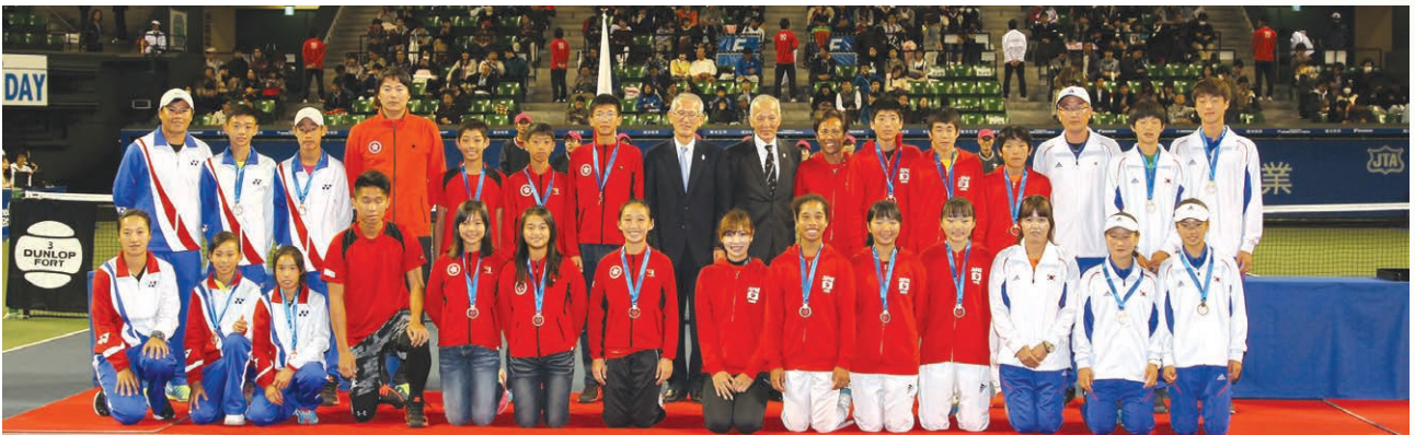
East Asia Junior Team Tennis