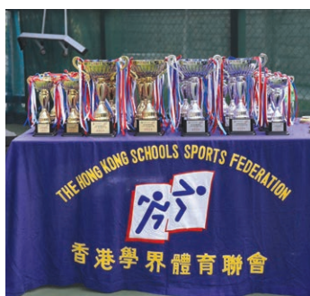
All Hong Kong Inter-Primary Schools Tennis Competition