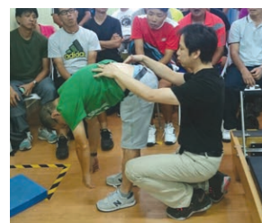
Common Injury in tennis