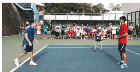
Continuous Professional Development Programme Workshop (July)